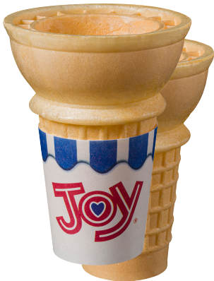
Joy #30 (with or without jacket) Height: 3 ⅙" Mouth Width: 2 ½" Inside Dia.: 1 ⅙" Bottom Outside Dia.: 1 ¼"