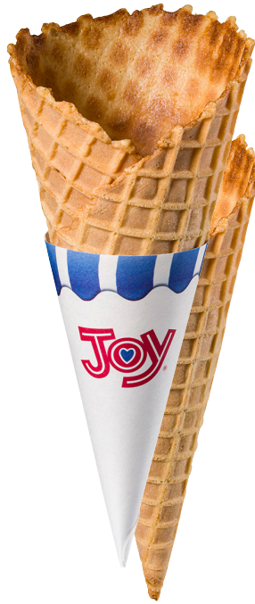
Joy #7180 Joy #7192 (with or without jacket) Height: 7" Mouth Width: 3" Inside Dia.: 2 ¾" Bottom Outside Dia.: Tip