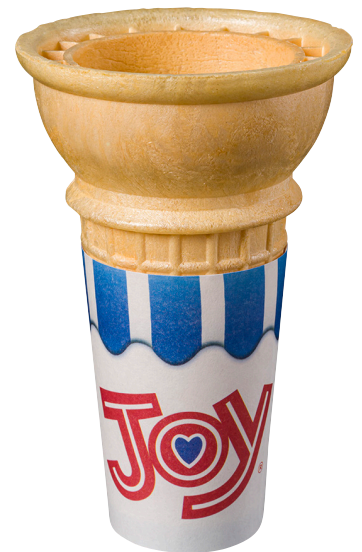
Joy #80 (with or without jacket) Height: 4 ½" Mouth Width: 3 ⅛" Inside Dia.: 2 ¼" Bottom Outside Dia.: 1 ½"