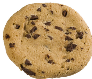
Joy Chocolate Chip Cookie

Our philosophy at Joy is... "offer the customers the highest quality product at a reasonable price and they will become repeat customers." That is what we do at Joy!