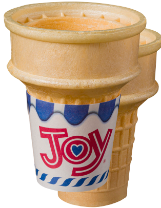
Joy #40 (with or without jacket) Height: 3 ⅜" Mouth Width: 2 ⅝" Inside Dia.: 1 ⅞" Bottom Outside Dia.: 1 ⅜"