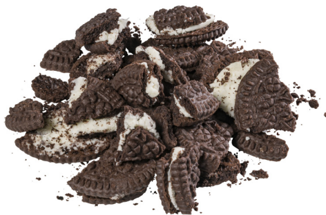
Joy Cookie and Creme Inclusions