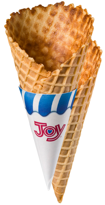
Joy #W7198 Joy #W7216 (with or without jacket) Height: 7" Mouth Width: 3 ⅛" Inside Dia.: 2 ¼" Bottom Outside Dia.: 1 ½"