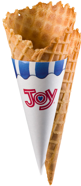
Joy #6216 Joy #6228 (with or without jacket) Height: 6" Mouth Width: 2 ⅝" Inside Dia.: 1 ¾" Bottom Outside Dia.: Tip