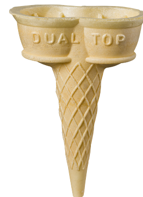
Joy Twin Scoops

(with or without jacket) Height: 4 1/16" Mouth Width: 2 3/16" Inside Dia.: 1 3/8" Bottom Outside Dia.: Tip