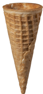
Joy #450S Sugar Cone Sampler

Height: 2.87 - 3.11" Bottom Outside Dia.: Tip