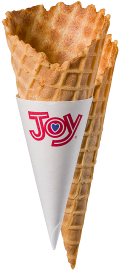
Joy #5276 Waffle Joy #5288 Waffle (with or without jacket) Height: 5 ¼" Mouth Width: 2 ¾" Inside Dia.: 2 ½" Bottom Outside Dia.: Tip