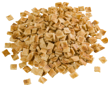
Joy Waffle Pieces