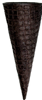
Joy Sugar Cones made with Oreo Pieces

Height: 4 5/8" Mouth Width: 1 7/8" Inside Dia.: 1 11/16" Bottom Outside Dia.: Tip