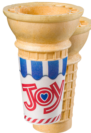
Joy #60 (with or without jacket) Height: 3 ⅓" Mouth Width: 2 ⅞" Inside Dia.: 1 ⅞" Bottom Outside Dia.: 1 ⅞"