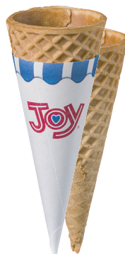
Joy #415 Sugar Joy #310 Sugar (with or without jacket)

Height: 2.87 - 3.11" Bottom Outside Dia.: Tip