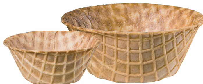
Joy Mini Waffle Bowl

(without jacket) Height: 4 5/8" Mouth Width: 1 7/8" Inside Dia.: 1 11/16" Bottom Outside Dia.: Tip