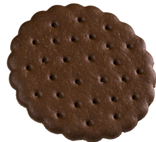
Joy Chocolate Wafer