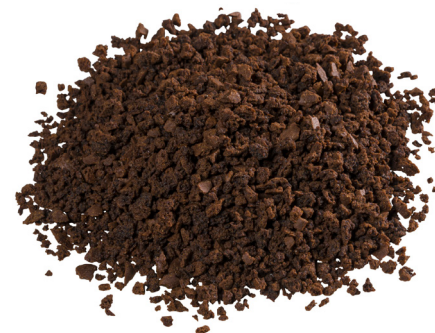
Joy Chocolate Crunch